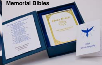
High Quality Magnetic Closure