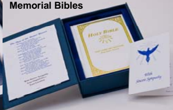
High Quality Magnetic Closure